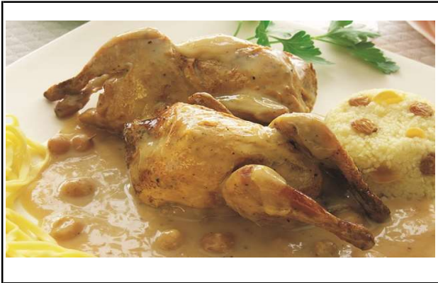
N° Ekta : 463

Two roasted quails flambé with Armagnac, delicately simmered in a delicious sauce with foie gras and grapes: a refined recipe for an elegant dinner.