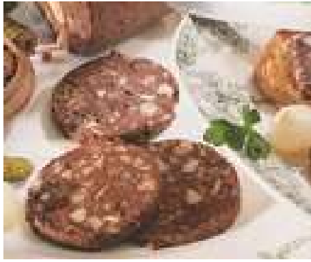
N° Ekta : 423